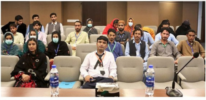
The students of Turbat University – Balochistan visited the Pakistan Stock Exchange, Karachi. The Pakistan Stock Brokers Association in collaboration with the Darson Securities conducted awareness session for them on Investment at Capital Market.