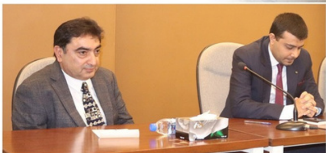
The students of Turbat University – Balochistan visited the Pakistan Stock Exchange, Karachi. The Pakistan Stock Brokers Association in collaboration with the Darson Securities conducted awareness session for them on Investment at Capital Market.