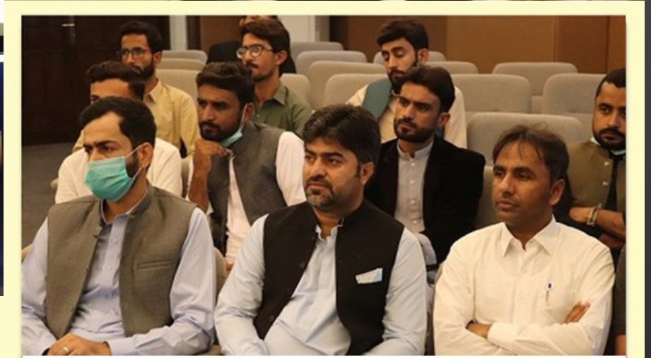
Student and Faculty Members of Turbat University – Balochistan visited the Pakistan Stock Exchange