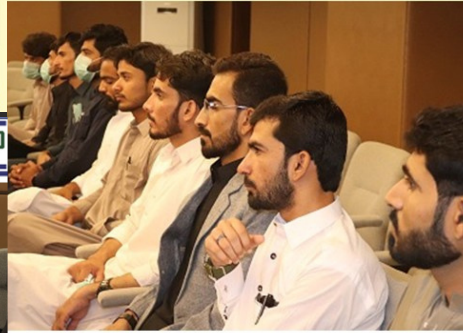
Student and Faculty Members of Turbat University – Balochistan visited the Pakistan Stock Exchange