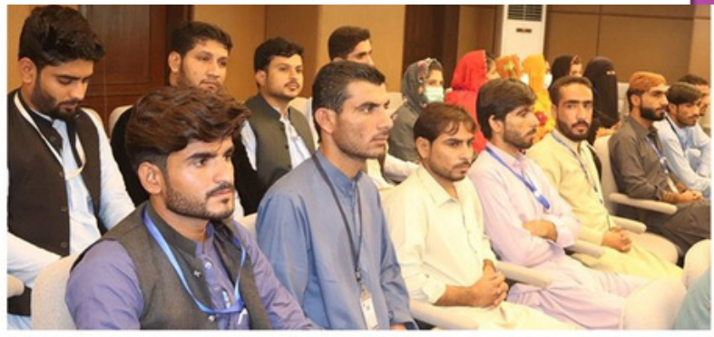
The students of Turbat University – Balochistan visited the Pakistan Stock Exchange, Karachi. The Pakistan Stock Brokers Association in collaboration with the Darson Securities conducted awareness session for them on Investment at Capital Market.