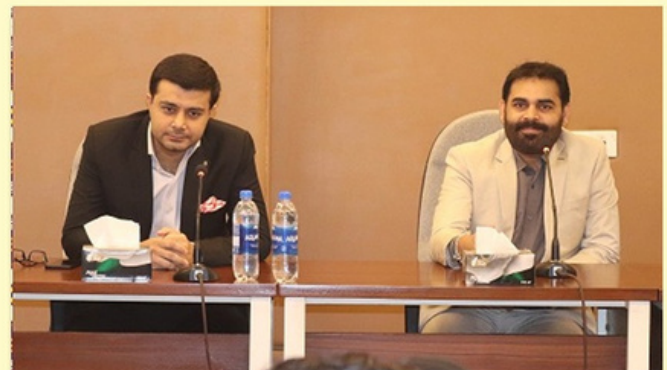
Student and Faculty Members of Turbat University – Balochistan visited the Pakistan Stock Exchange