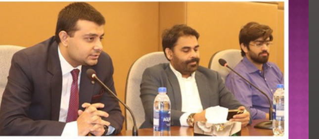
The students of Turbat University – Balochistan visited the Pakistan Stock Exchange, Karachi. The Pakistan Stock Brokers Association in collaboration with the Darson Securities conducted awareness session for them on Investment at Capital Market.