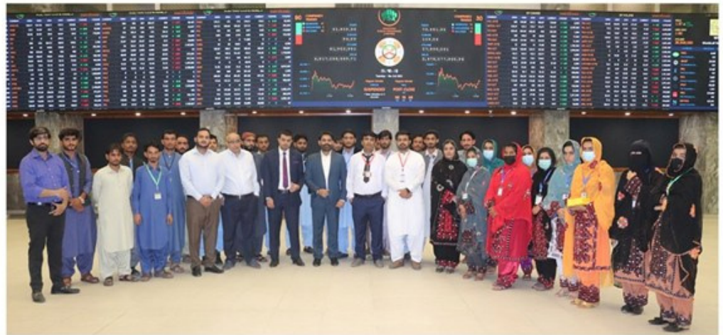
The students of Pakistan Stock